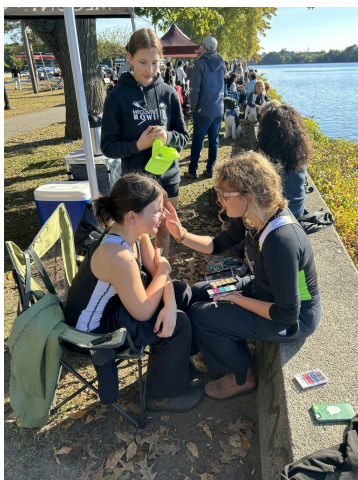
Happy Mixed Masters Quad at HOCR; Below: Meg Rowers at Cow Island