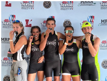
Mixed Jr 4+ and their Second Place Medals!